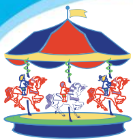
Festival of Children Foundation

Directions to South Coast Plaza: San Diego Fwy (405) at Bristol Street. For more information call (714) 438-3286.