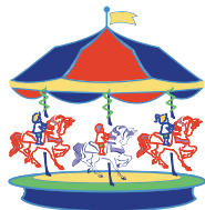
Festival of Children Foundation

To learn more, please visit: festivalofchildren.org